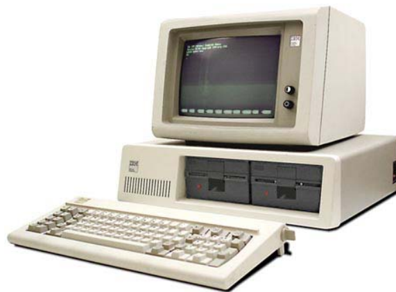
Fig. 3 – The IBM 5150 Personal Computer

In the early 1980's, computer desktops began hitting the home consumer market. With advancements in computer technology, it became increasingly feasible for families to own and operate a computer. Several companies were already heavily into the home computer market such as Apple, Commodore, and Atari. Because there was no real standard by which to follow however, most of these machines were incompatible with each other. Many of their designs also lacked conformity in terms of look, feel, and usability. Atari, Commodore, and Texas Instruments designed computers which made use of the television for the display and were nothing more than small computers integrated into a large keyboard. Although somewhat successful, these machines were often advertised as gaming machines so they were never really taken seriously in business. Other manufacturers like KayPro, NEC, and Altair either came with built in screens for their portables, or required an expensive external proprietary monitor. It was not until IBM released the 5150 in 1981 that computers as we know them today began to take their familiar shape.