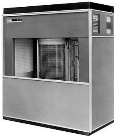
Fig. 1 – The IBM 305 Disk Storage System

One of the earliest and most influential companies to develop magnetic media disk storage technology was IBM. For almost three decades, IBM dominated the industry with innovative advancements on an almost annual basis. Framing on much of the original concept of digital tape storage by the ERA Corporation and other previous tape innovations, IBM went to work on a new type of magnetic storage. IBM had amassed an elite team of engineers in the early 1950's known to be true pioneers in their field. It was no surprise then that in 1956, IBM released a newly developed piece of hardware known as the 305 RAMAC. The RAMAC, short for Random Access Method of Accounting and Control, was the world's first computer with a disk storage system.