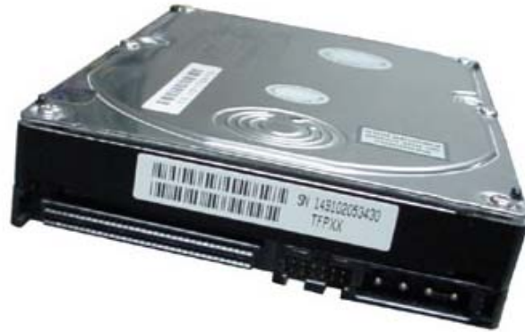
Fig. 7 – 3.5” HH Hard Drive w/ SCSI 80-Pin Connector (Computer Circulation Center) USA,

The second technology, Small Computer System Interface or SCSI for short, was also significantly more advanced than MFM. Although originally standardized in 1986, this technology did not get fully utilized until the mid 1990’s. Like SCSI, the controller hardware was built into the drives themselves, and the connection system served only to transmit actual program data back and forth on the bus.