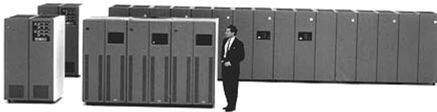
Fig. 2 – The IBM 3390 Expandable Direct Access Storage Device

Improved speed and storage capacity continued with the subsequent release of models such as the 1405, 2305, 2314 and 2321. As desk and office dumb-terminals began to hit the market, IBM focused their hardware development on supporting mainframe storage systems. In the early 1970's, they released several new data storage units starting with the IBM 3330 direct access subsystem. These new units began to take shape into the type of equipment more commonly seen throughout the 1980's and 1990's. The 3330 was followed in order by the 3340, 3350, 3858, 3310, 3370, 3380 and finally the 3390. Each new unit significantly increased capacity with a considerably reduced physical size.