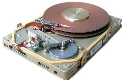
Fig. 4 – The Seagate ST-225 20mb 5.25" HH MFM Hard Disk (exposed) (Jailbird) Wikipedia, 9/10/2006

Known as the Personal Computer or PC for short, this early IBM computer literally created an entire foundation of standards for both use and design. The IBM 5150 provided a solid platform that could be configured to meet almost any household budget. Although the IBM PC made use of Basic as well as Microsoft's DOS operating system, what made it especially dominant in the industry was its upgradability. Within two years of its release, IBM began offering the PC with a 10 megabyte hard drive (Wikipedia). Although officially released as the IBM 5160 PC/XT in 1983, all previous 5150 PCs could be upgraded with this hard disk. The design of this new hard-drive coupled with the design layout of the 5150 set the physical standards for all future drive components ("Our History of"). This type of storage technology in the home had never before been available and was well received despite its high cost. As with the 5160 and all other early PC compatibles, there were several dominant hard disc manufacturers. The most notable of these manufacturers was Seagate. Their first personal computer hard disk, including the one found in the IBM 5160 PC made use of a new standard drive technology known as Run Length Limited (RLL) and Modified Frequency Modulation (MFM).