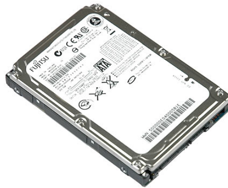
Fig. 6 – 2.5” Fujitsu IDE Hard Disk Drive (Computer Circulation Center) USA,

from 1990 to 1995, the average hard disk capacity grew from about 40 megabytes to 250 megabytes. This rate of growth grew exponentially with storage capacity exceeding well into the 1 to 2 gigabyte range by the year 2000 for most personal computers. The typical desktop computer hard-drive existed in half-height 3.5” format. With the popularity of laptops quickly growing through the late 1990’s, manufacturers required even smaller drives to combat excessive weight and heat buildup in their machines. Developed originally by PrairieTek, the 2.5” form factor laptop hard disk drive was invented.