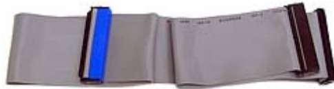
Fig. 6 – Integrated Drive Electronics / PATA cable (NewEgg)

It was not until the early 1990's that significant demand was again put on disk manufacturers to improve upon the basic hard disk design. Although technology had improved relatively steadily, the biggest improvement was cost. Storage and speed had remained relatively unchanged however. As computers became a staple in the average American household, more demands were being placed on them. The onset of multimedia technology became immediately apparent with the advancement of computer game technology. With graphical word processing and improved computer game graphics, the need for more disk storage and performance grew. Manufacturers immediately stepped up their research and development and introduced two new standards of hard disk control technology. The first, Integrated Drive Electronics, known as IDE for short, provided the most common and standard means for driver control.